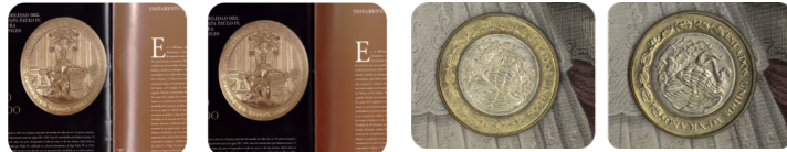
GLARE CONTROL SYSTEM