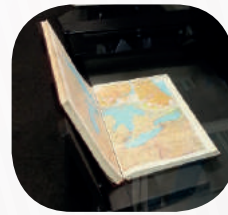
Optional V Book Holder (2x A2 or 2x A1)