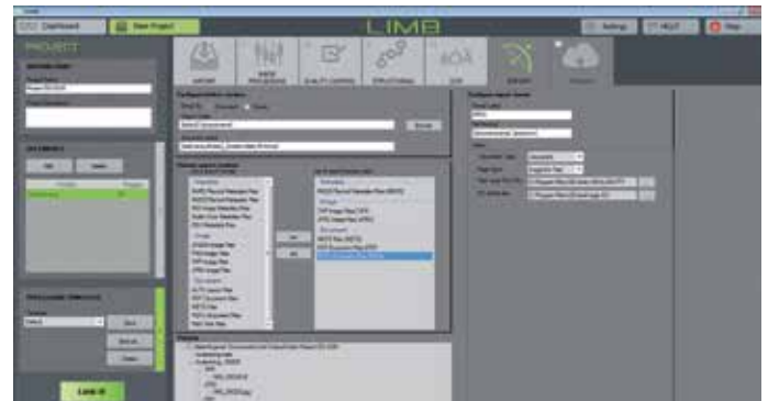
Multiple export settings