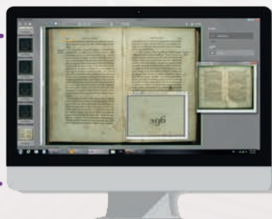
Manage camera, book cradle, light and glass plate