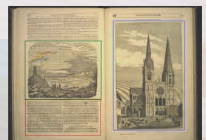
Multi saving frames different files formats output