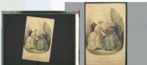
Document detection and automatic crop

Self service interface: - Automatic document detection and cropping - Live saving - Multiple saving formats: FTP, E-mail, Printer, Cloud (WebDAV), Google Drive, Dropbox, USB - LIMB Capture provides a API to connect your own monetize system