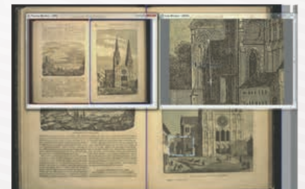
Zoom into the scan window