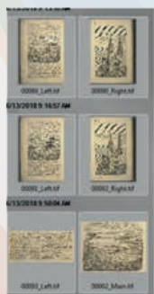
Thumbnails flow delete/add/insert images