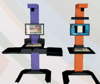
EXAMPLES OF WALK-UP CONFIGURATION, KIOSK FOR SELF-SERVICE USE