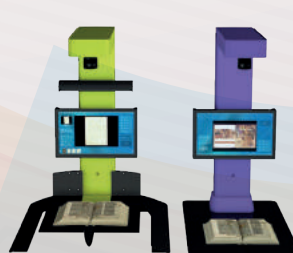
EXAMPLES OF TABLE TOP CONFIGURATION, TO BE INSTALLED ON YOUR OWN TABLE