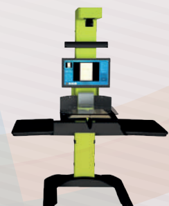
EXAMPLE OF WORKING STATION CONFIGURATION, SCANNER'S FEET LIE ON THE FLOOR FOR A SEATED USE